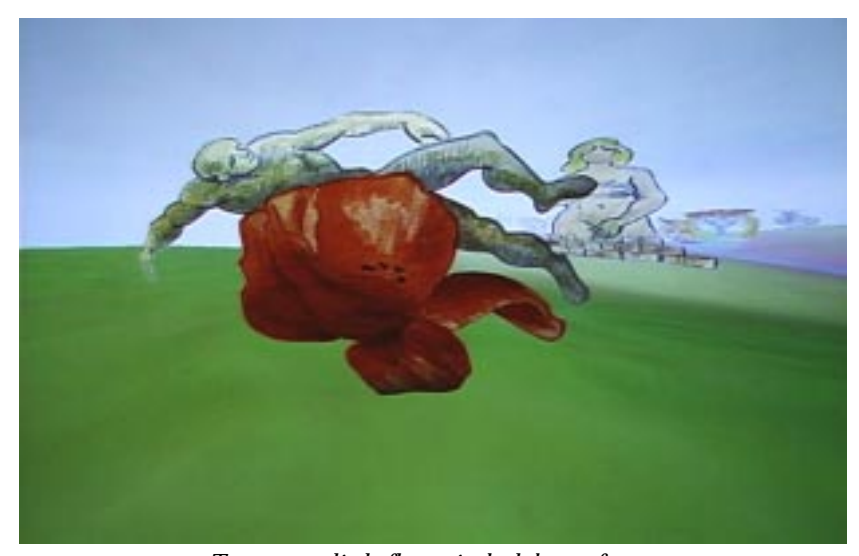
To create a little flower is the labour of ages.

Portfolio: http://collaboratory.nunet.net/phertz/portfoli/