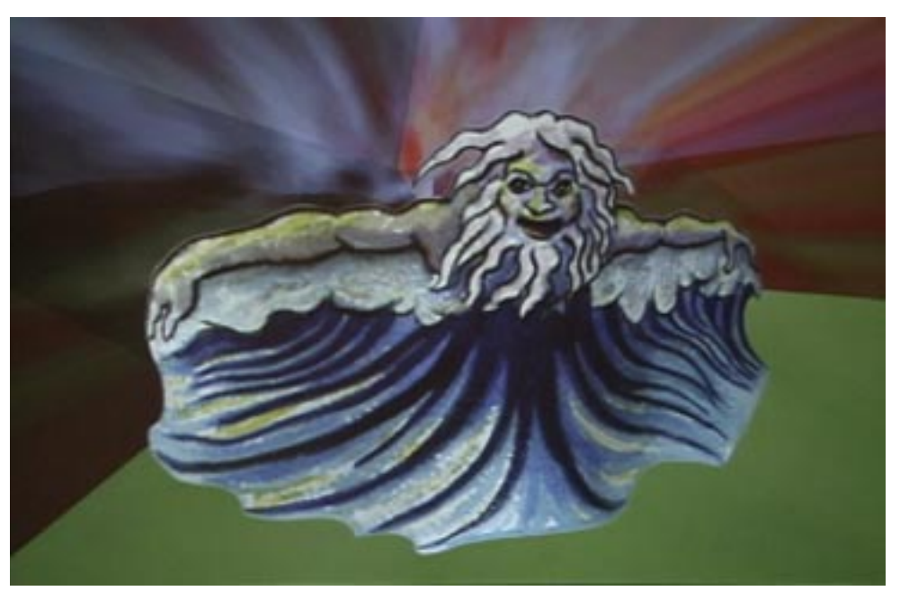
The roaring of lions, the howling of wolves, the raging of the stormy sea, and the destructive sword. are portions of eternity too great for the eye of man.